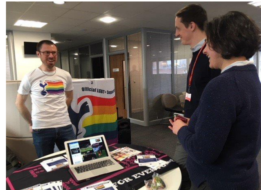
Stall at LGBTHM Haringey Council event