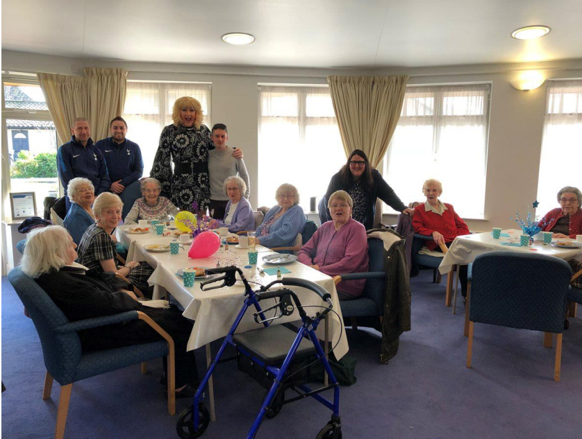
Jackson's Lane Broadway Brunch with Spurs Foundation

This year we have also built a relationship with Jackson's Lane Creative and Cultural Hub and are part of a newly formed Haringey LGBT+ Network. We have also created a new connection with Highgate School and the London Academy of Excellence in Tottenham.