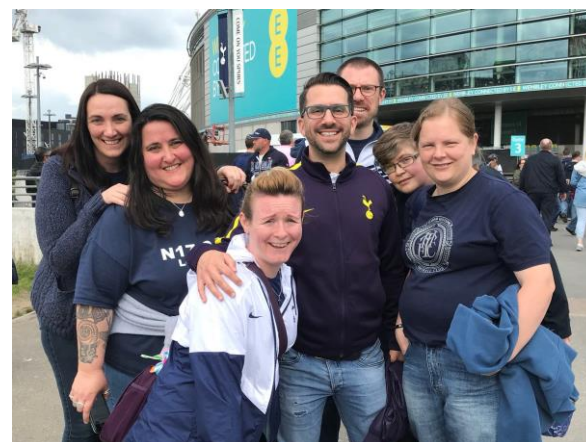
At Wembley for the final game of the season