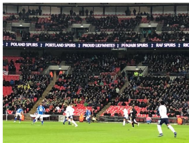
On the ticker at Wembley

The new TV Ident for @SkySportsPL channel is fabulous! (Even though I'm in it!) It features @gaygooners @CanalStBlues @LFC_LGBT @SpursLGBT @Learsenal14 @designbyTBC Thank you @SkySports #ArsenalForEveryone @stonewalluk #RainbowLaces @prideinfootball