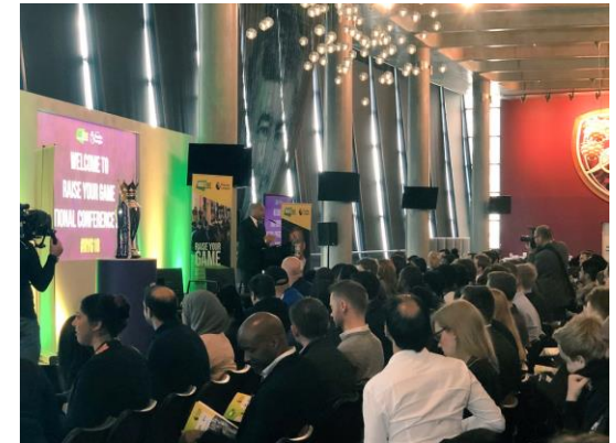
Kick it Out Raise Your Game Mentoring