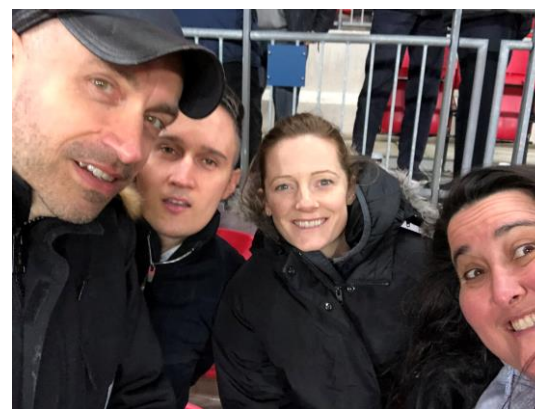
...and with our wonderful Patron