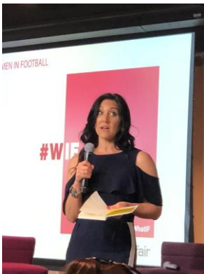
Launch of Women in Football WhatIf? Campaign