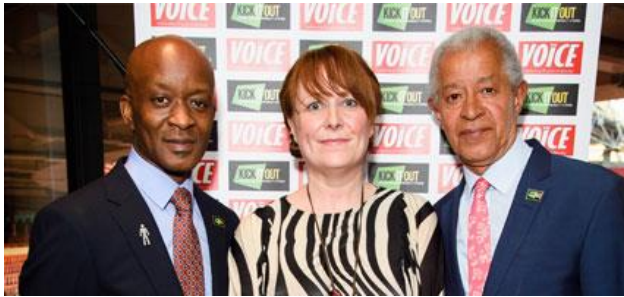
Kick it Out 25 th Anniversary launch

Once again we have continued to enhance our relationships with valued external stakeholders in football. These include Kick It Out, the FA, the Football Supporters Federation and Fans for Diversity. Through out the year we have joined events to discuss not only LGBT+ issues, but also women and BAME people in football.