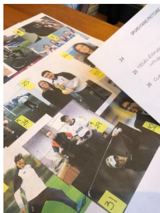
...at the THST Pub Quiz Night