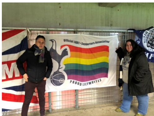
In Turin & Dortmund

Proud Lilywhites - Annual Report 2016/2017