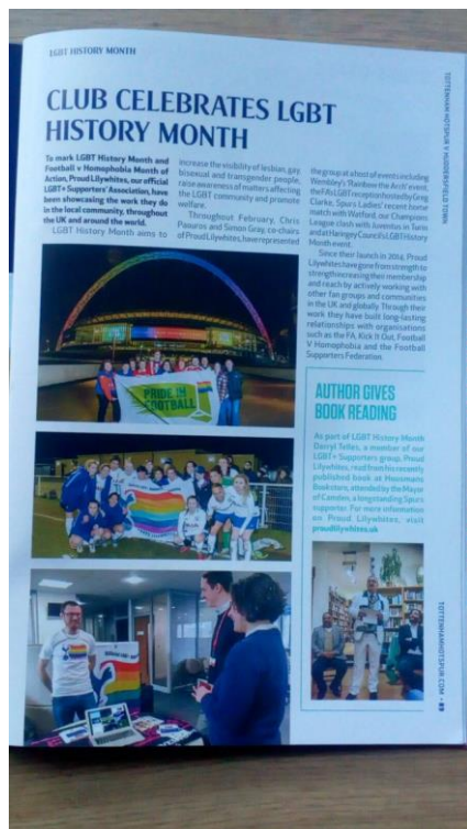
LGBTHM round up in programme