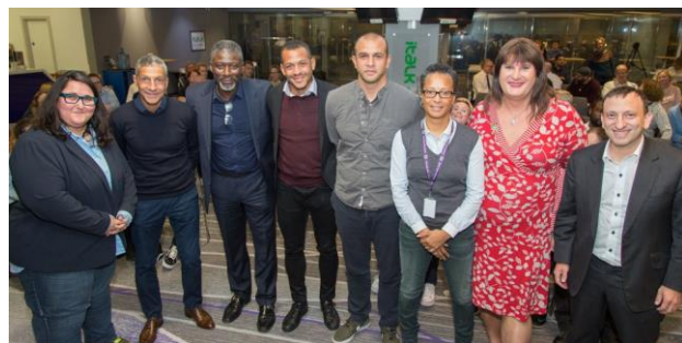
KIO panel on equality in football at Brighton & Hove

Shortlisted for Football Supporters Federation Fans for Diversity award