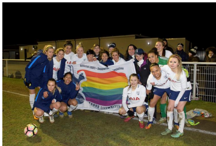
With the Spurs Women's 1st team