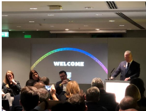
LGBTHM Reception at the FA