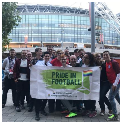
With Pride in Football at England

As well as arranging meet ups before home games we have also been on the road for Champions League games and met with other Spurs fan groups both home and abroad.