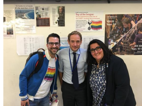
Highgate School lunchtime event