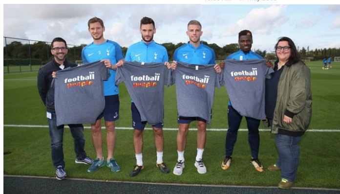
Fare Football People activation at Hotspur Way

Shortlisted for Football Supporters Federation Fans for Diversity award