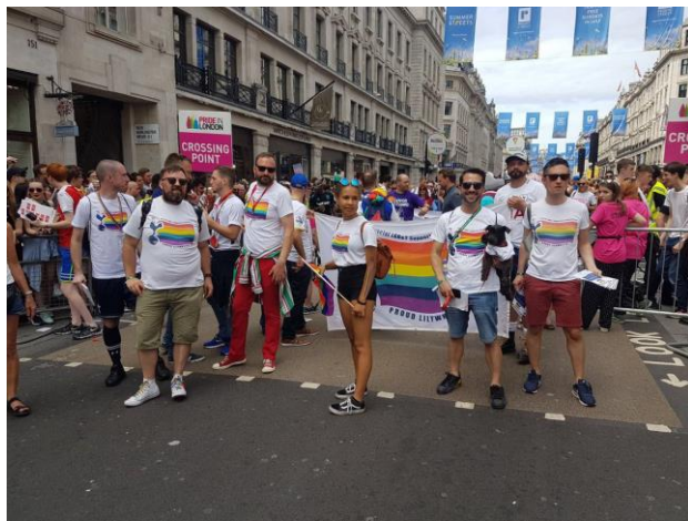
Pride in London

Here's just a taster of all the great things we've done this year to raise awareness of LGBT+ Spurs fans.